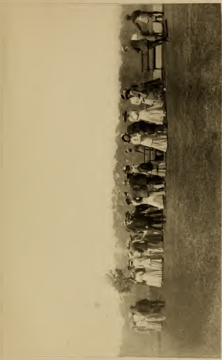
NEW GOLF COURSE .